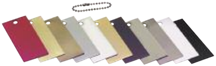
CAT. NO. SDCSK Color Chip Chain